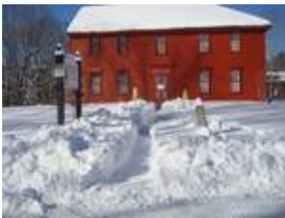
Thank you Norwich Tigers Organization!