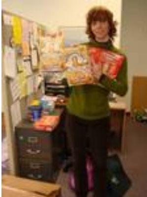
Newman's Own made a difference to us and we made a difference to the SVDP Kitchen!